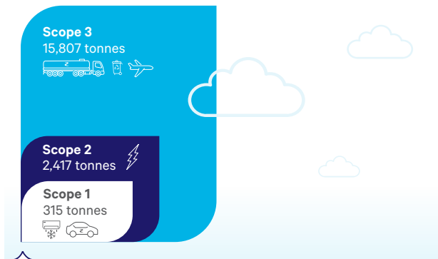
Figure 1: Z's CY23 GHG emissions inventory (tCO 2 -e) (not shown to scale)